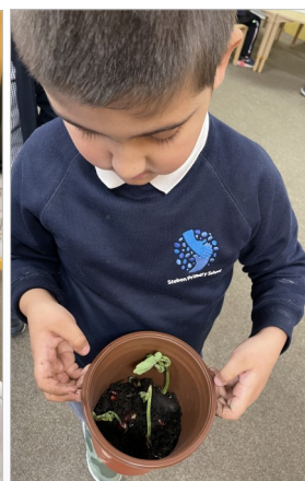
Tower Hamlets Explorers: Nature Lovers