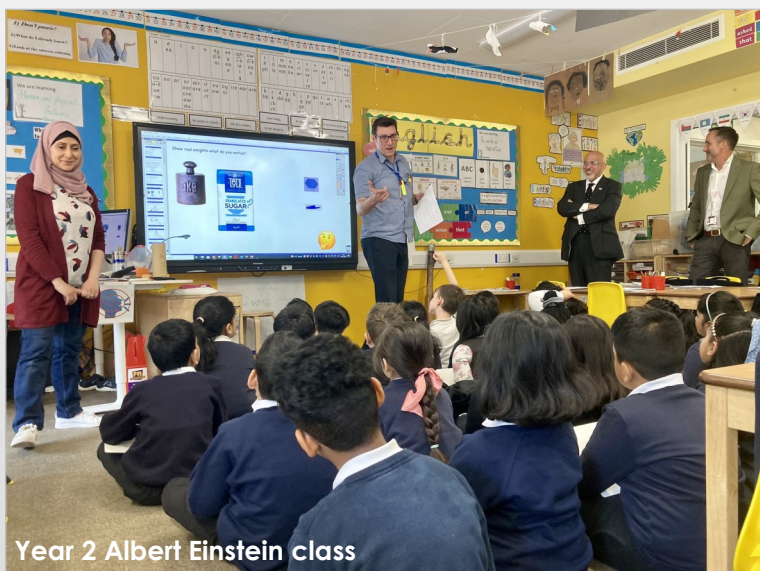
Year 2 Albert Einstein class

I was so impressed by the leadership within the trust and want to wish teachers, support staff and children the very best as SATs begin 📝