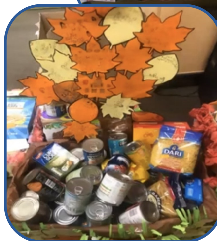
Y3 RS's box