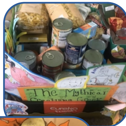
Y5 NM's box