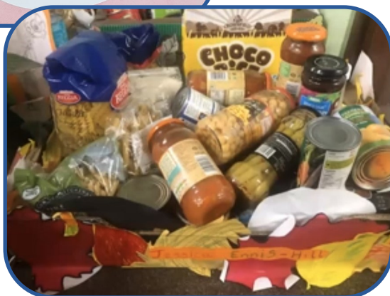
Y1 JEH's box