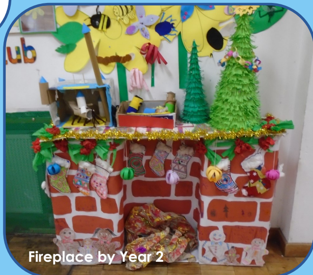
Fireplace by Year 2

Thank you to everyone who took part and please remember to Switch it Off! Every little thing we do, does count.