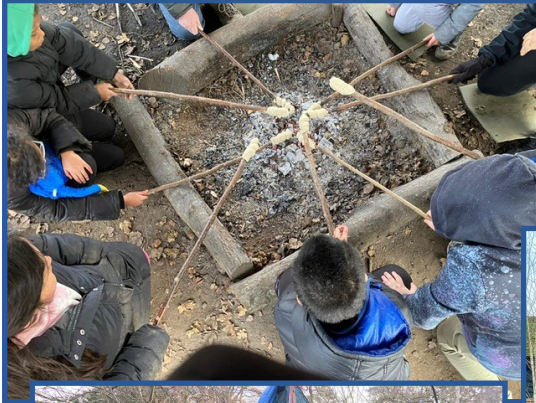
Rosa Parks class