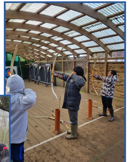
Hellen Keller class