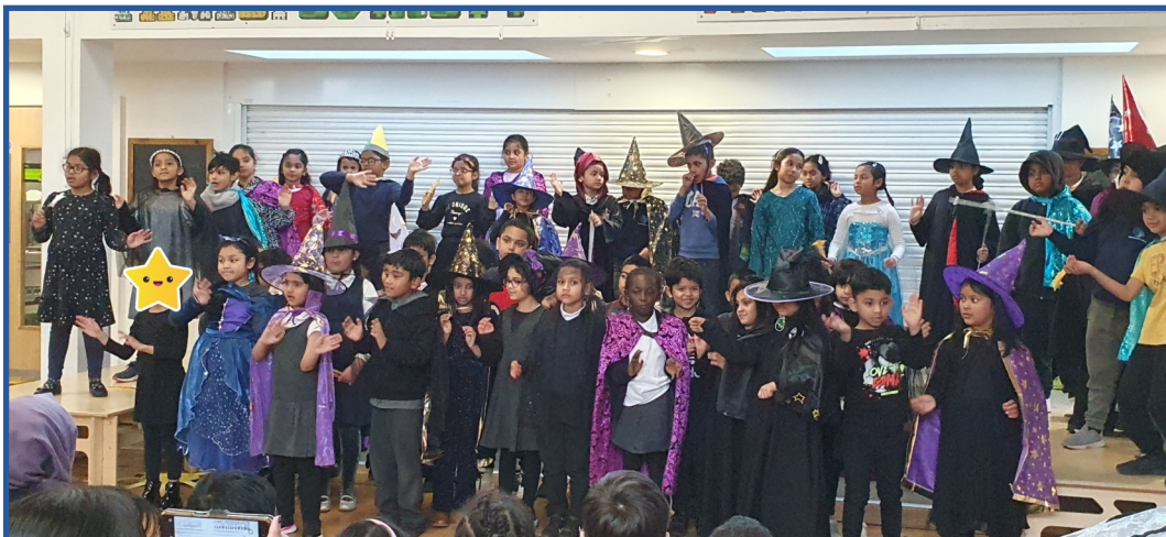
Ravi Shankar & Brian Cox classes