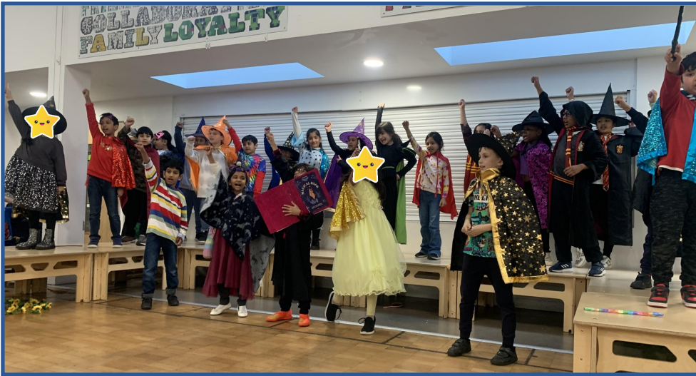
Ella Fitzgerald class