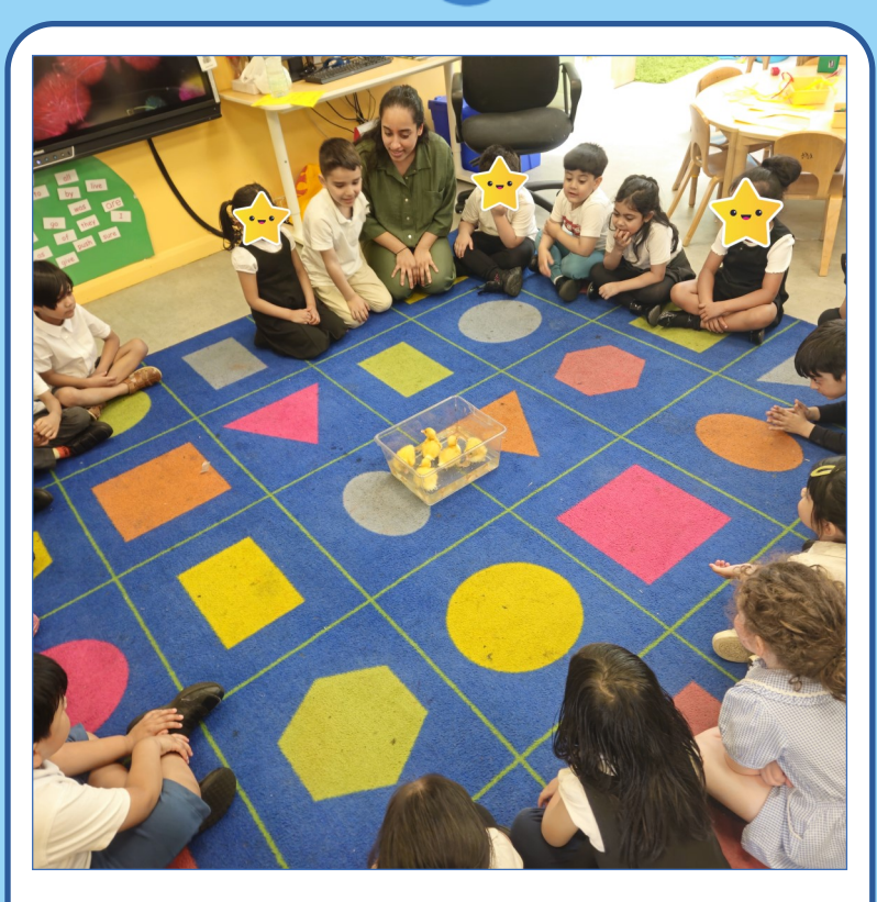
We have had some new additions in Reception ducklings! Here they are having their first swim in Beatrix Potter class.

This week in Art Club we have been using glue and paints to make beautiful vibrant colours 3D jellyfish.