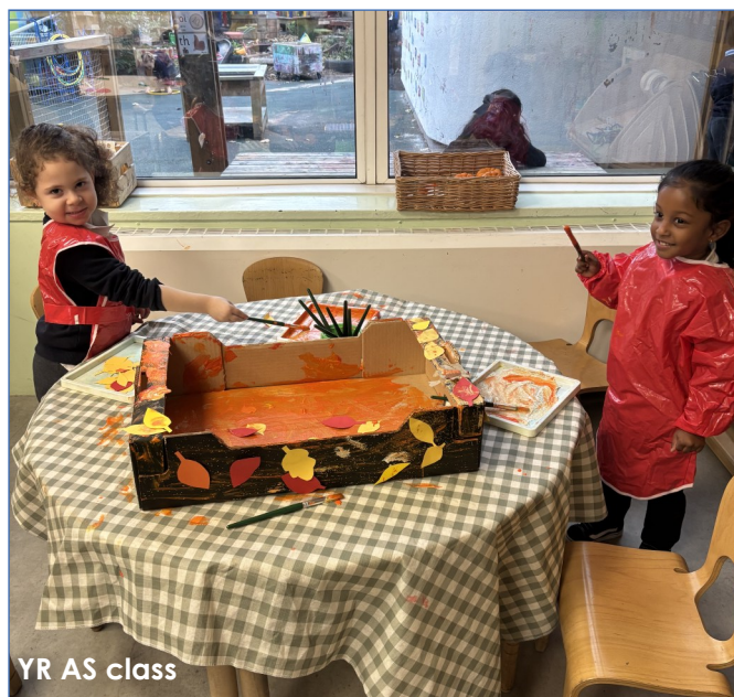
YR AS class

There's still time to bring in donations on Monday!