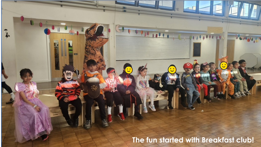
The fun started with Breakfast club!

We celebrated World Book Day at Stebon yesterday. Everyone had the chance to strut down the runway and show off their costumes in the annual Stebon WBD Runway Show!