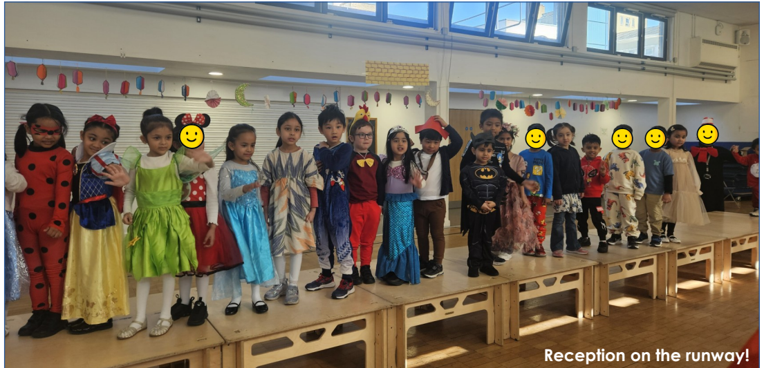
Reception on the runway!