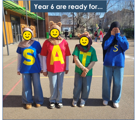
Year 6 are ready for...